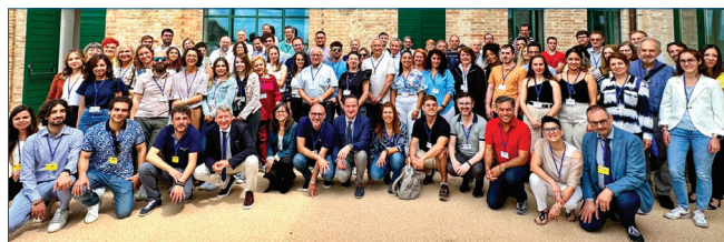
Fig. 1 - Group photo of participants to ISMEC 2023